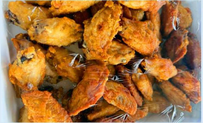
SOUTHERN THAI CUISINE · PAPAYA SALAD & FRIED CHICKEN